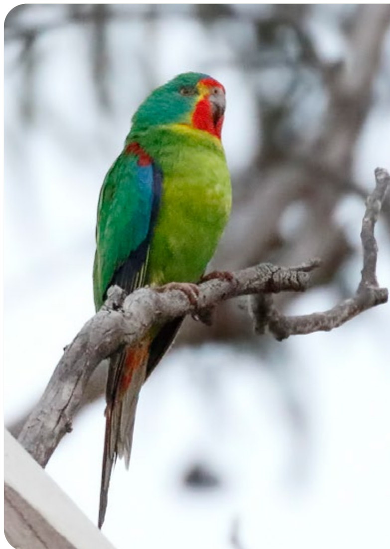
Swift Parrot.