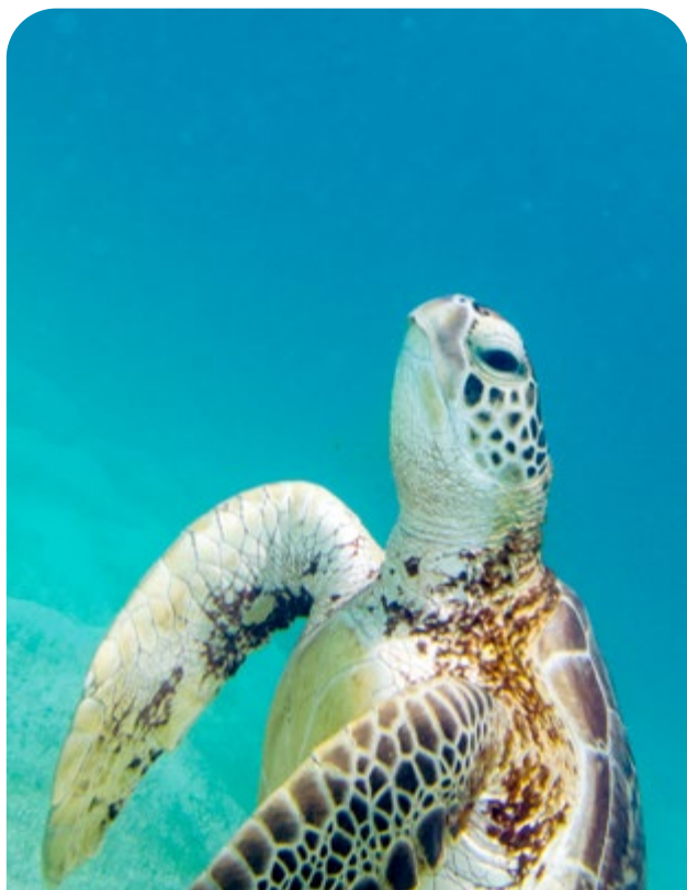
Green Sea Turtle, Queensland.

This is a clear example of the need for Commonwealth involvement and oversight in accredited schemes and ongoing compliance to ensure that Australia's international obligations in relation to environmental management are met and nationally listed species are protected.