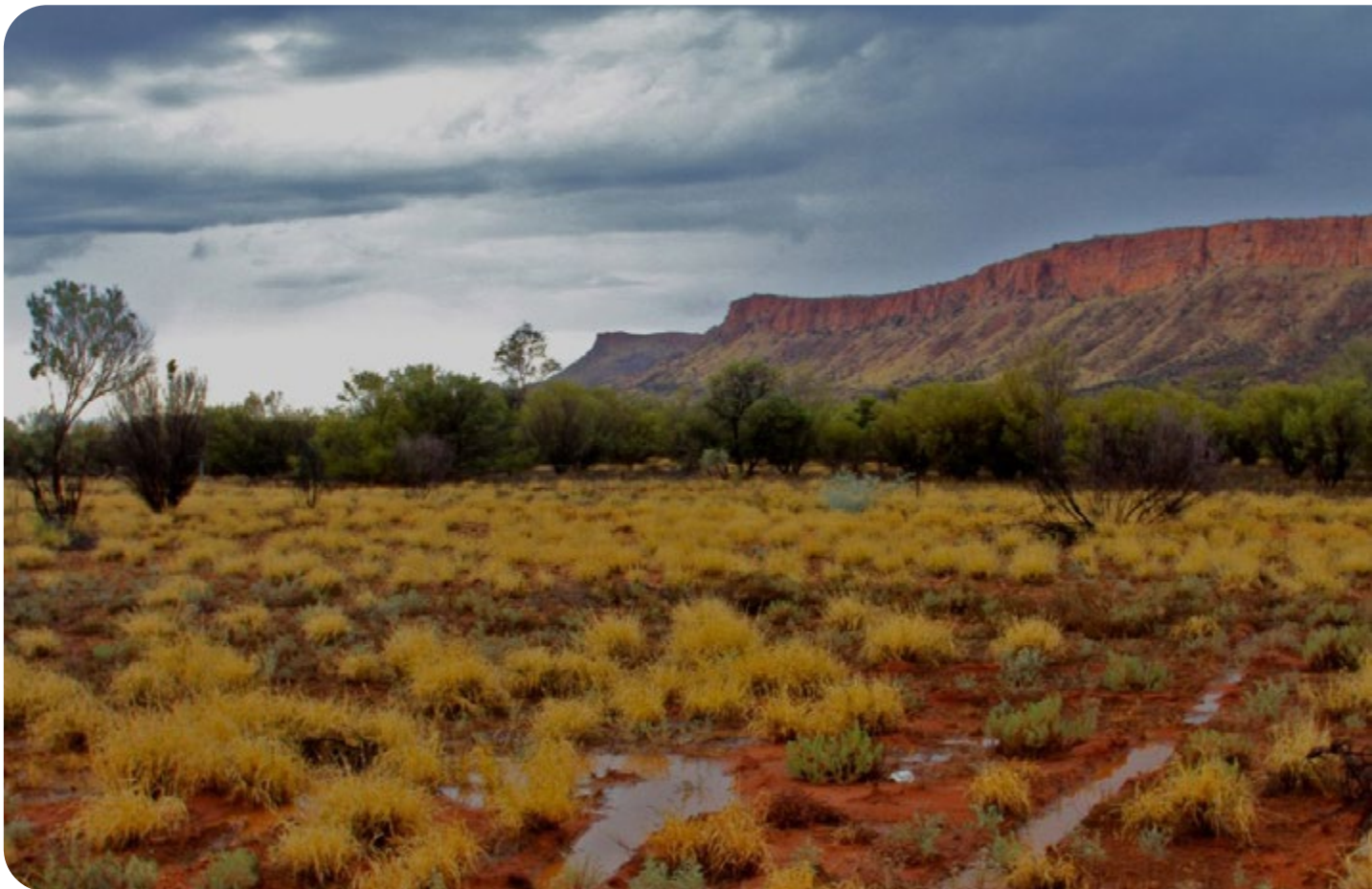
Northern Territory, landscape after rain, Environmental Defender's Office.

It is extraordinary that clearing of this scale was not referred to the Commonwealth and did not trigger the EPBC Act. This case study demonstrates the sheer scale of what can be approved by a territory government without adequate environmental impact assessment.