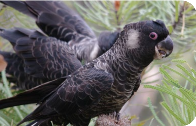
Carnaby's black cockatoo.

Carnaby's Black-Cockatoo is federally listed as Endangered, and the Perth-Peel subpopulation of Carnaby's Black-Cockatoos is estimated to have declined by 35% since 2010, due to the ongoing clearing of foraging and roosting habitat on the Swan Coastal Plain. With more than 70 per cent of banksia woodland now cleared, the species has become increasingly reliant upon pine plantations north of Perth to survive.