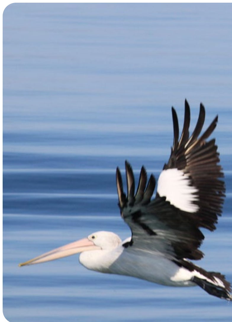
Pelican, Moreton Bay Marine Park.

Serious questions have been asked around the proponent's influence over the development assessment process, and the impacts on public scrutiny and accountability that have arisen from a confidentiality deed entered between the developer, the local government and the state government which has prevented open consideration and discussion of the controversial project. 41 Further, in 2016, while the project was actively being considered by the federal Coalition Government, the developer donated $200,000 to the federal Liberal Party. Developer donations are banned