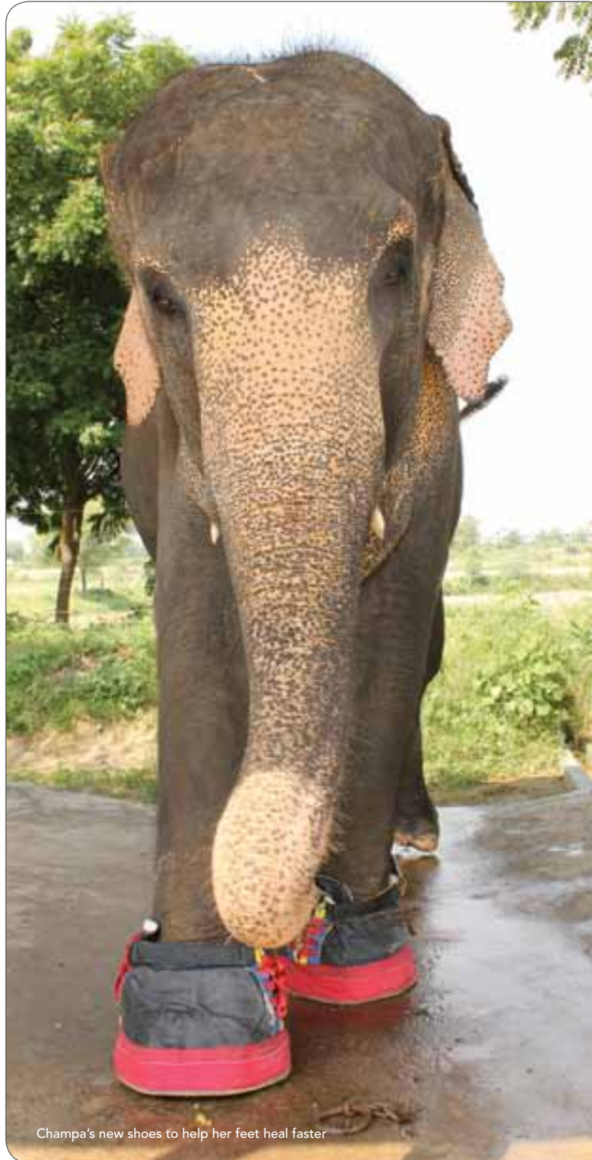
Champa's new shoes to help her feet heal faster

These many challenges will of course continue into 2011, not the least of which will be our participation in the international talks on climate change, whales and tropical forests. We thank our supporters for all their help through 2010, and can assure you that we will be fighting just as hard for the animals and their environments in 2011.