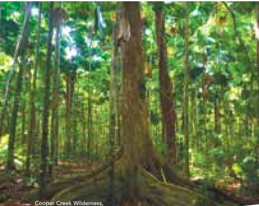
Cooper Creek Wilderness, in the heart of the Daintree