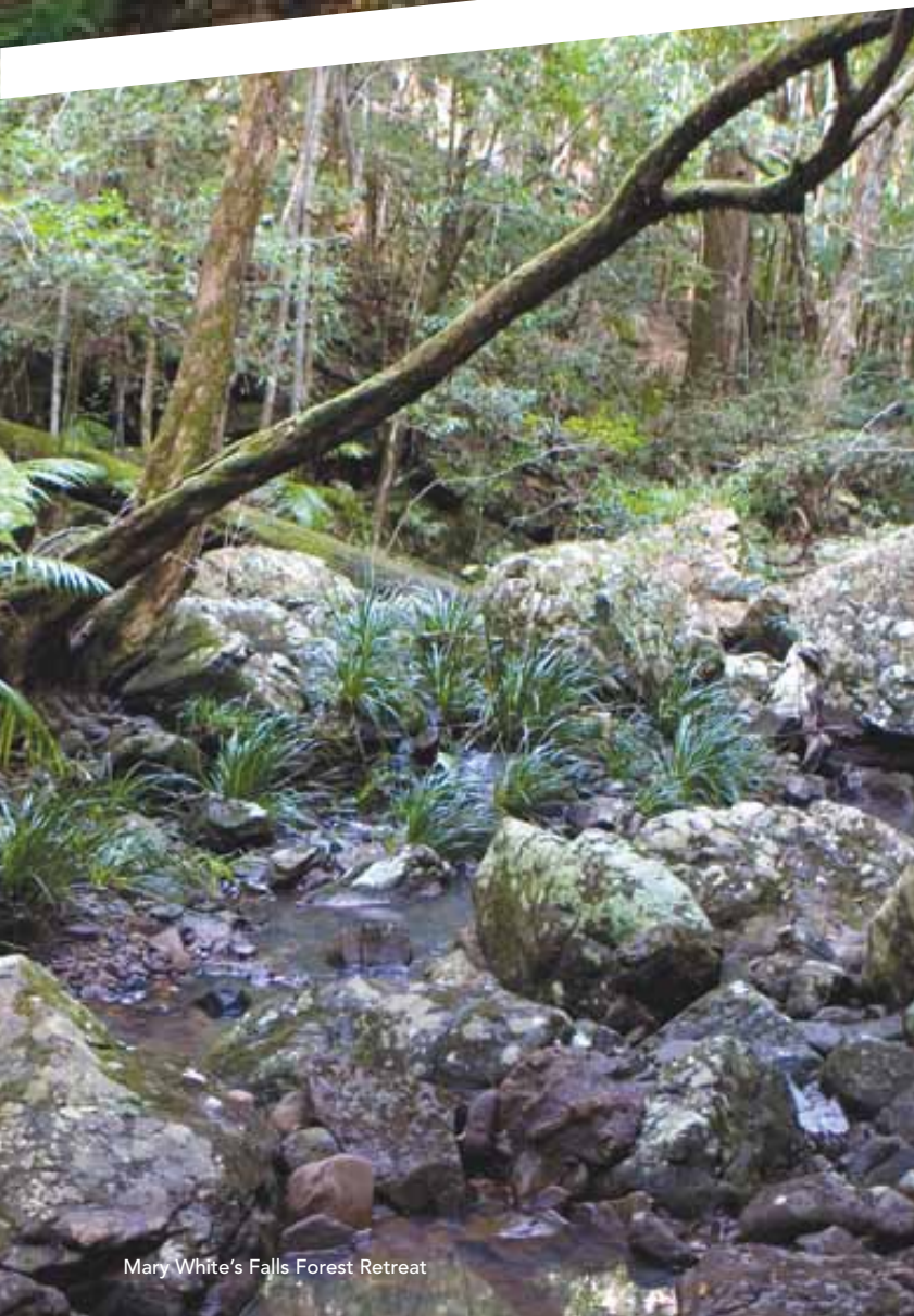
Mary White's Falls Forest Retreat