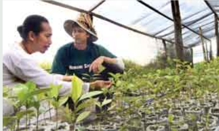
Actor Peter O'Brien in Kalimantan, with the Director of the Friends of the National Parks Foundation, where HSI supports a reforestation program.

Carbon emissions from deforestation and biodiversity degradation are responsible for an estimated 25% of global greenhouse gas emissions, yet incentives to reduce this source of emissions were omitted from the Kyoto Protocol. HSI is at the front line of the international campaign to ensure Reduced Emissions from Deforestation and Degradation (REDD) are included in the climate change treaty being finally negotiated in December 2009. ♻️