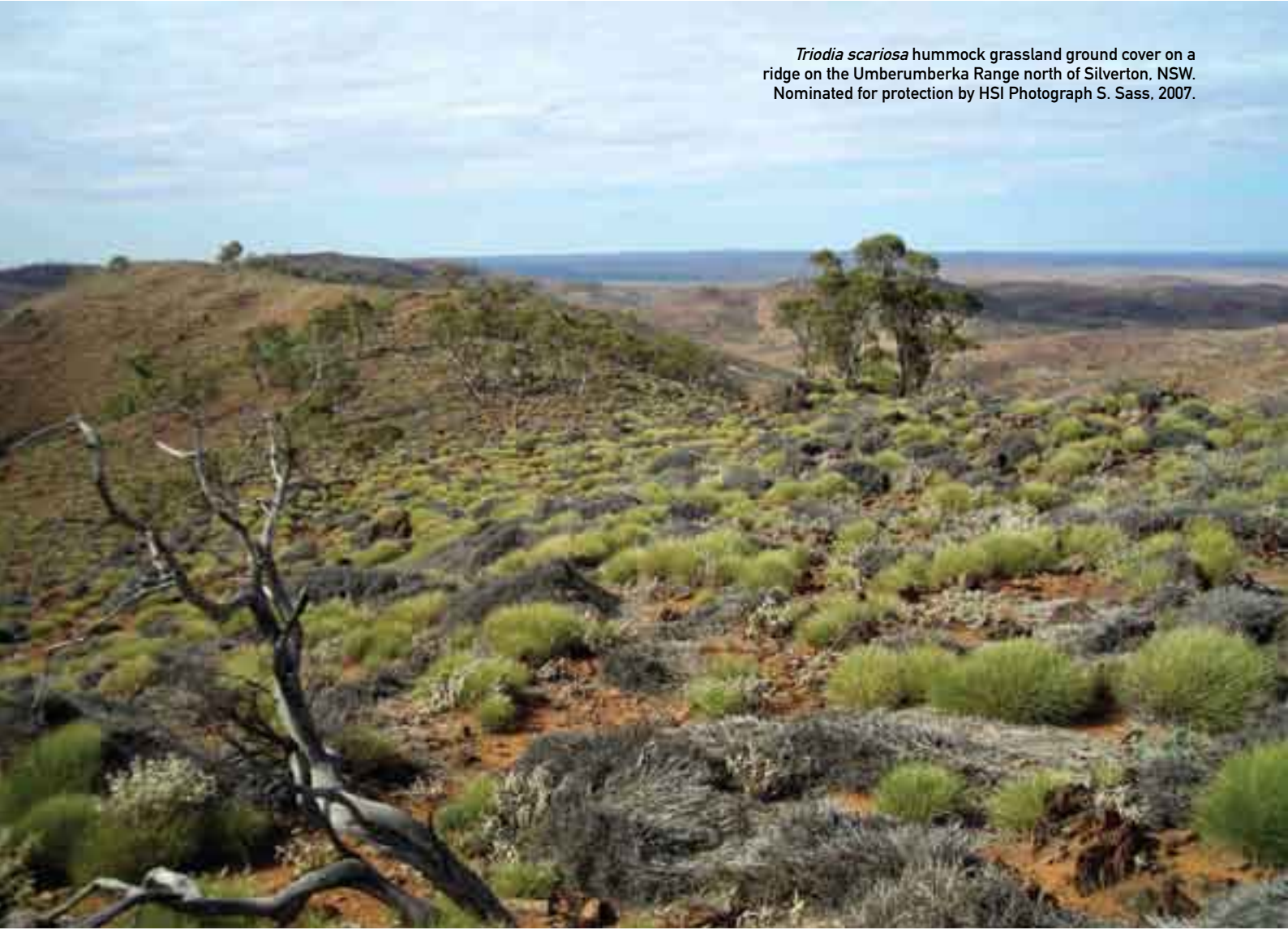
Triodia scariosa hummock grassland ground cover on a ridge on the Umberumberka Range north of Silverton, NSW. Nominated for protection by HSI Photograph S. Sass, 2007.