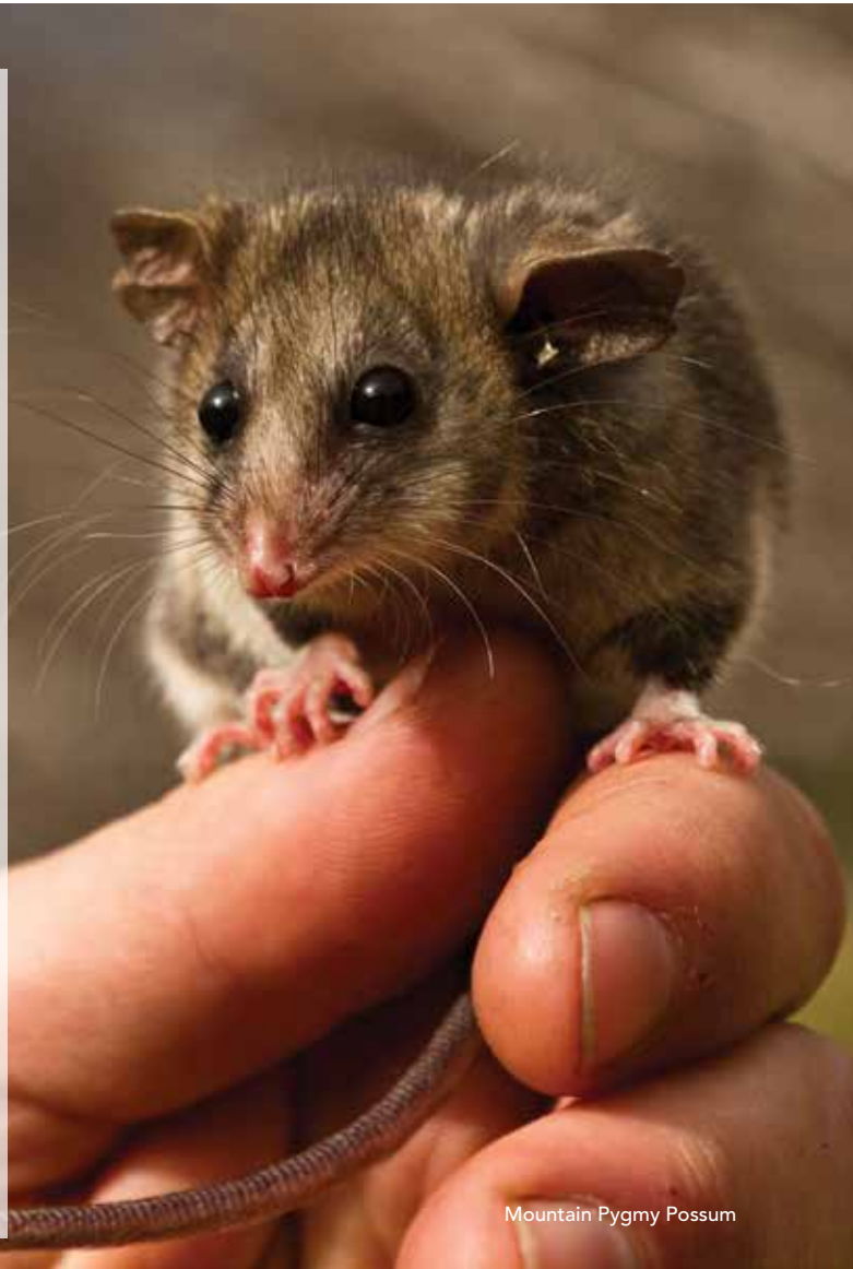
Mountain Pygmy Possum

HSI has been leading the fight against this environmentally disastrous move, which will set our environmental laws back nearly 40 years. The Federal Government has already moved to give back its powers to protect threatened flying foxes, and we will be doing all in our power to stop this unprecedented attack on what is considered one of the strongest national environment laws in the world.