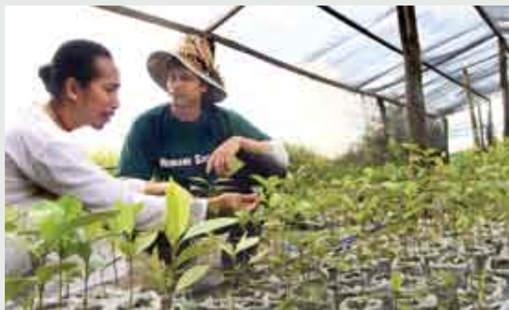
Actor Peter O'Brien in Kalimantan, with the Director of the Friends of the National Parks Foundation, where HSI supports a reforestation program.

Carbon emissions from deforestation and biodiversity degradation are responsible for an estimated 25% of global greenhouse gas emissions, yet incentives to reduce this source of emissions were omitted from the Kyoto Protocol. HSI is at the front line of the international campaign to ensure Reduced Emissions from Deforestation and Degradation (REDD) are included in the climate change treaty being finally negotiated in December 2009. 🌱