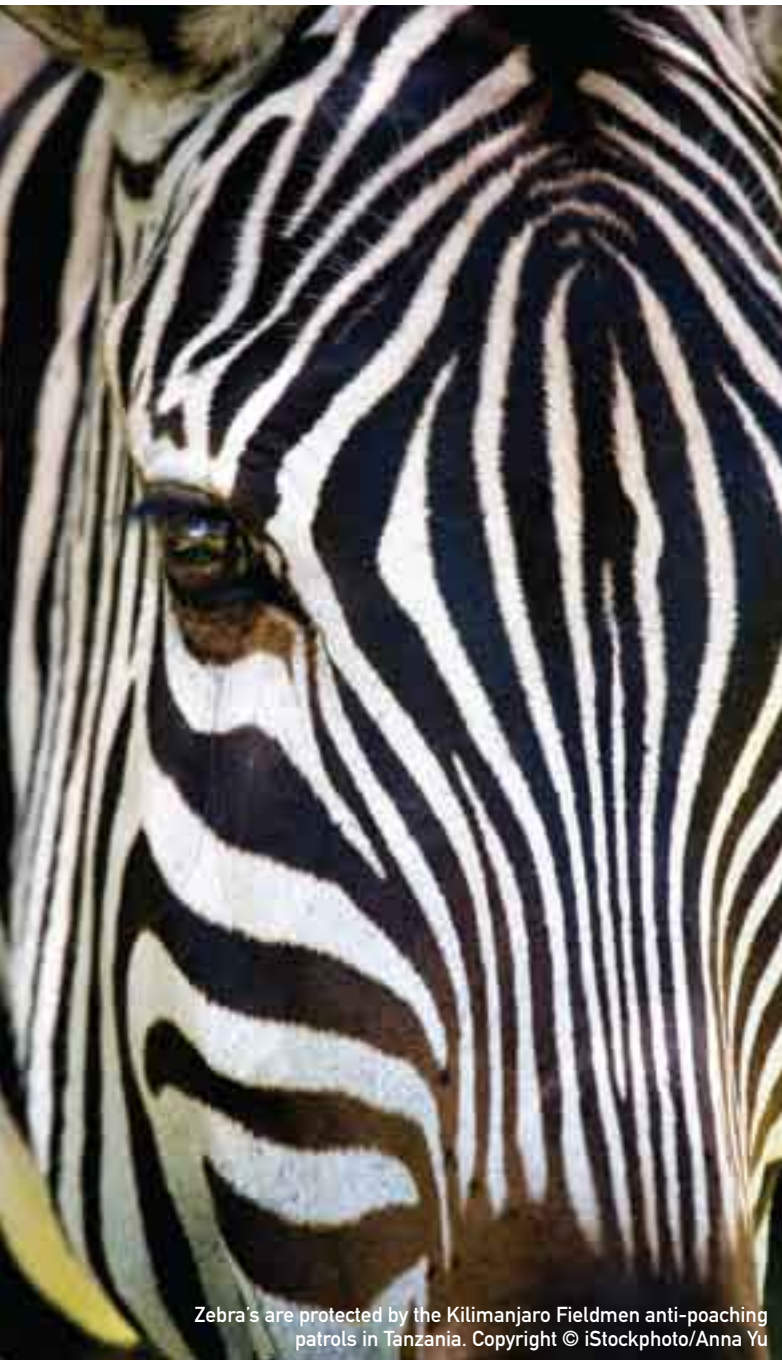
Zebra's are protected by the Kilimanjaro Fieldmen anti-poaching patrols in Tanzania.

A nother hectic year at HSI has almost passed and we are just so grateful for the generosity of our supporters who make our work possible. In this annual review, while we run literally dozens of campaigns, we have decided to highlight eleven of our most high profile issues and projects, showing you at a glance the breadth and success of our achievements.