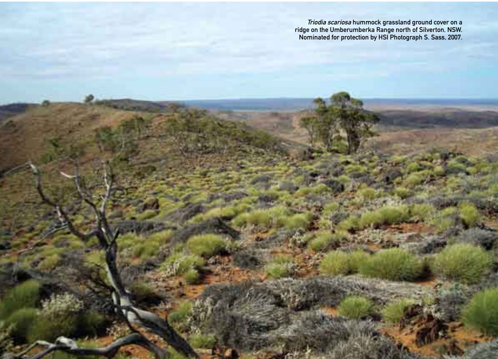
Triodia scariosa hummock grassland ground cover on a ridge on the Umberumberka Range north of Silverton, NSW. Nominated for protection by HSI Photograph S. Sass, 2007.